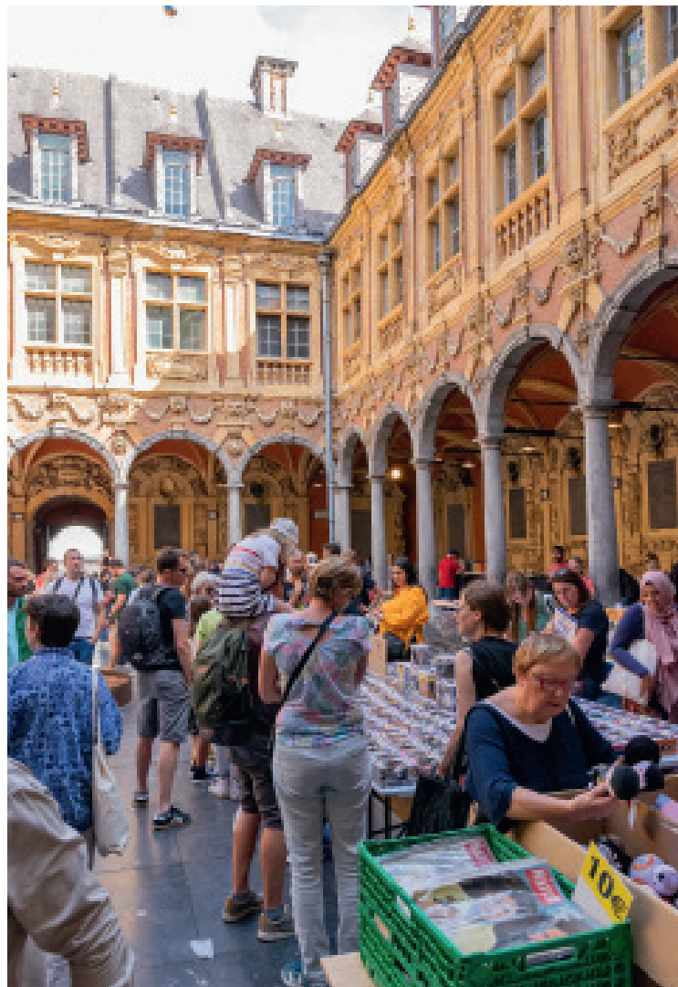
La Braderie de Lille takes over the Old Town in early September