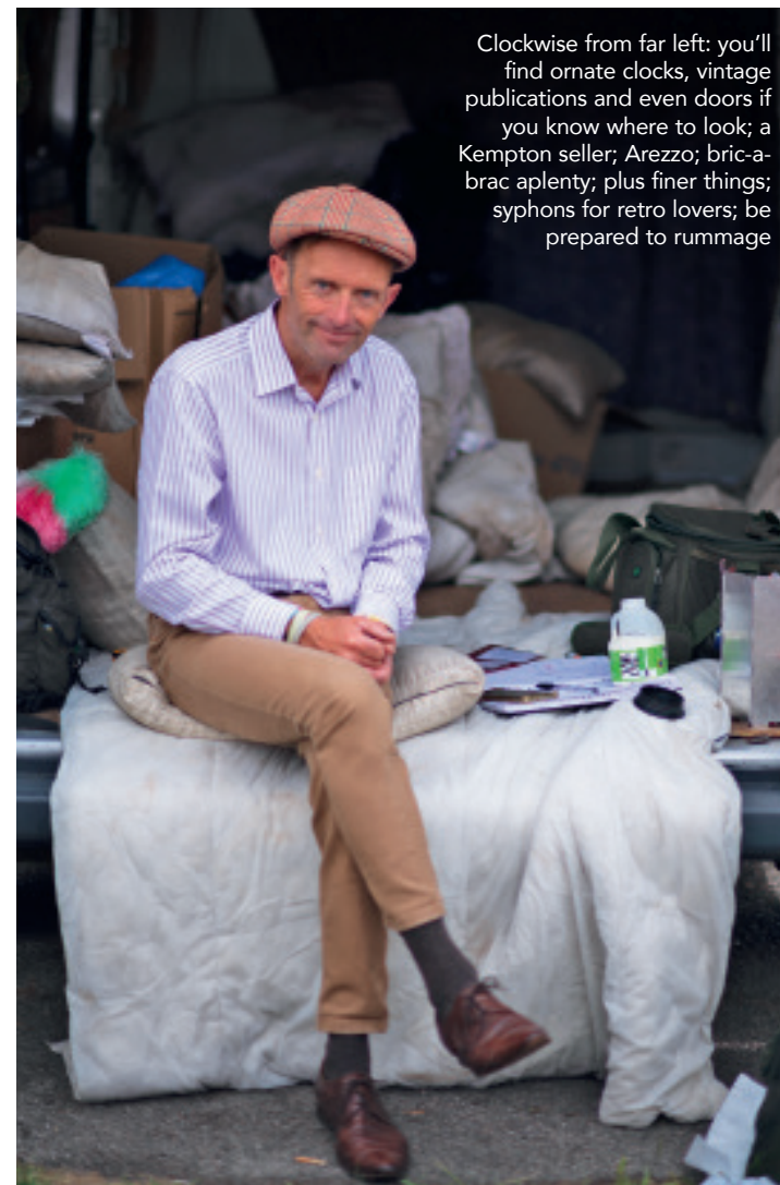
Clockwise from far left: you'll find ornate clocks, vintage publications and even doors if you know where to look; a Kempton seller; Arezzo; bric-a-brac aplenty; plus finer things; syphons for retro lovers; be prepared to rummage