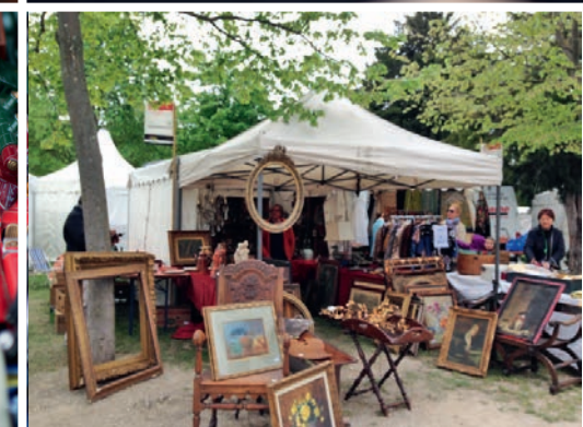
'Antiques aficionados hotly await the September dates of Europe's largest flea market, which takes over Lille's 17th-century Old Town, and just as important is the town's appetite: vast quantities of moules frites are served'