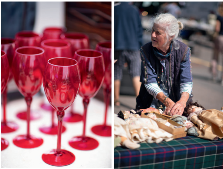
Clockwise from above left: get the full set; meet knowledgeable vendors; a colourful array for aficionados; be diverted by vintage items; ask about the origins of items you fancy; a frame to suit every picture; find a one-off; combine a trip to Paris with Pucés; history in portraits